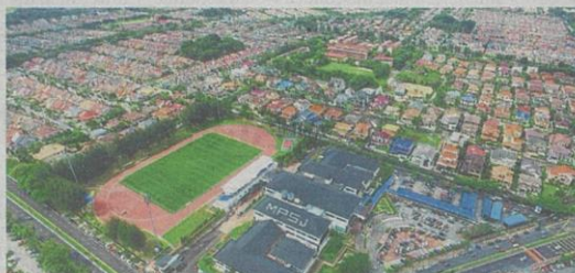
An aerial view of the MPSJ headquarters and surrounding neighbourhood. After 22 years as a municipality, MPSJ will finally be upgraded to a city council.

"On one hand, we don't have enough money to even pay the cleaners but on the other hand, people in general are having diffi-