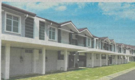
Projek Rumah Selangorku memberi pilihan lebih mampu milik kepada pembeli.