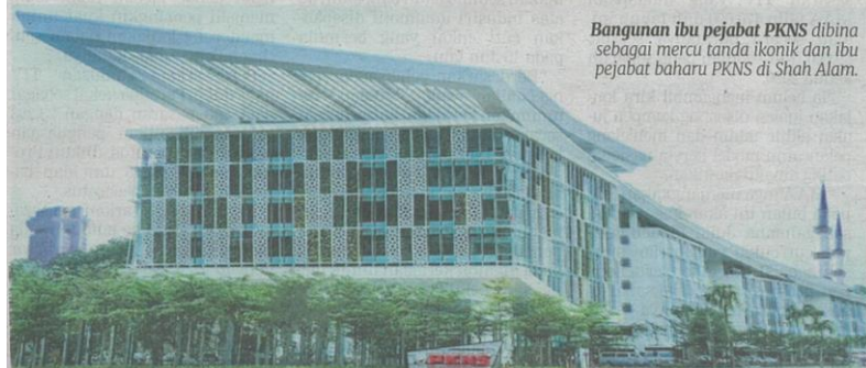
Bangunan ibu pejabat PKNS dibina sebagai mercu tanda ikonik dan ibu pejabat baharu PKNS di Shah Alam.