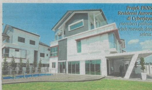
Projek PKNS Residensi Aurora di Cyberjaya memberi pilihan lebih mewah dan selesa.