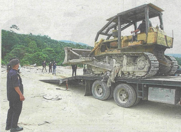
An MPKj officer observing a bulldozer that was seized from an illegal dumpsite in Kampung Sungai Serai during an operation in June.

"We will now seize vehicles involved in illegal rubbish dumping for one month and will not accept any appeal to return the confiscated vehicles before the end of the stated period," he said.